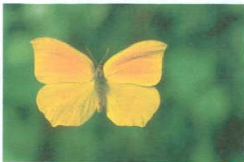
Janice Brayshaw ,RHN, RNCP

RNCs are required to carry professional liability insurance thus certain private or extended health care benefit plans cover their services. Check your policy to see if you have insurance coverage for complementary services.